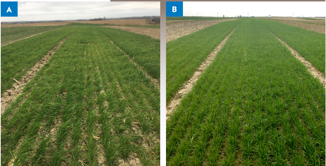
Figure 2. Field view of winter rye cover crop with (A) 1,000 lb/ac and (B) 2,000 lb/ac of dry matter biomass.

instance survived winter and was chemically terminated in spring (but in all other times winterkilled), and spring barley always winterkilled. Cover cropped plots were compared to plots without cover crops. Winter rye biomass was collected in the spring and annual ryegrass and spring barley was collected in the fall. Soil was collected at 0–12" and 12–24" 10 days prior to corn planting and analyzed for nitrate (NO 3 - ) and ammonium (NH 4 + ). Corn was no-till planted with starter N fertilizer in all plots on the same day, approximately 10 days after termination of the winter rye. The plots received various fertilizer rates over the season (six rates up to 240 lb-N/ac) and then harvested for grain. New plots were established each year; cover crop cumulative effects were not measured. The research was funded by the Wisconsin Fertilizer Research Program.